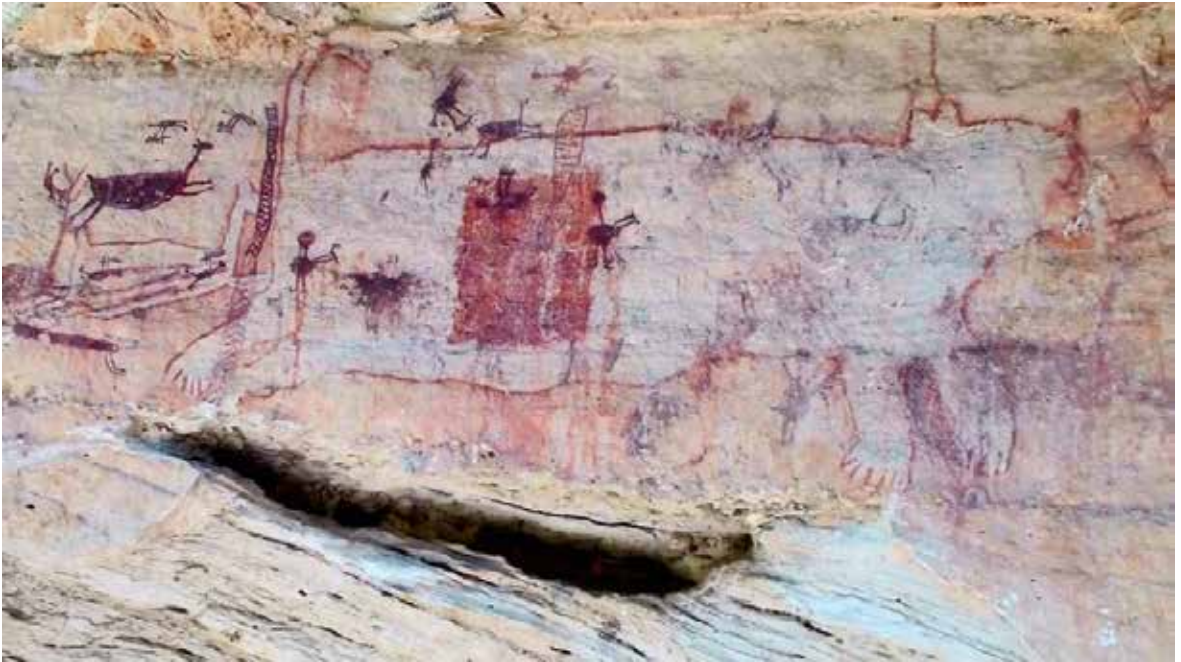
Figure 5. Serra da Capivara, Brazil. Figura 5. Serra da Capivara, Brasil.