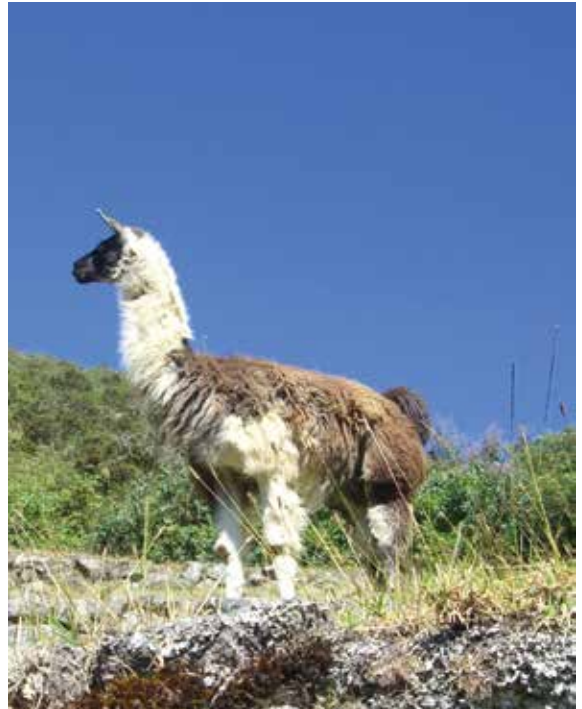
Figure 9. Llama profile. Figura 9. Perfil de llama.

back (fig. 9). In art this right-angle is highly diagnostic, as at Toro Muerto, Peru (fig. 10). On the other hand, in this example from Charcamata, Argentina (fig. 11), the essential elements are probably simply the small head, long neck and horizontal line of the back. The large bellies may indicate further detail: we recognize not merely the animal, but the animal as pregnant. In each case a salient feature, or features, will function in a part-for-whole way to identify the animal. It is what is known in ethology, and with original reference to the work of Tinbergen with gull chicks, as “fixed action pattern” or FAP (Tinbergen 1961). Just as the chick will peck at anything that has the salient feature of the parent’s beak—in particular a red spot—so we recognize things as a whole by registering a single or several salient parts. With respect to art, this has been notably examined by Deręgowski (1995), who sought to define salience—in his terminology, the “typicality” of a figure—mathematically by reference to Information Theory as elaborated by Attneave (1954). He coined the expression “typical contour” to describe canonical form—in many animal cases, the cervico-dorsal line. The thesis has its limitations. It applies only to outline