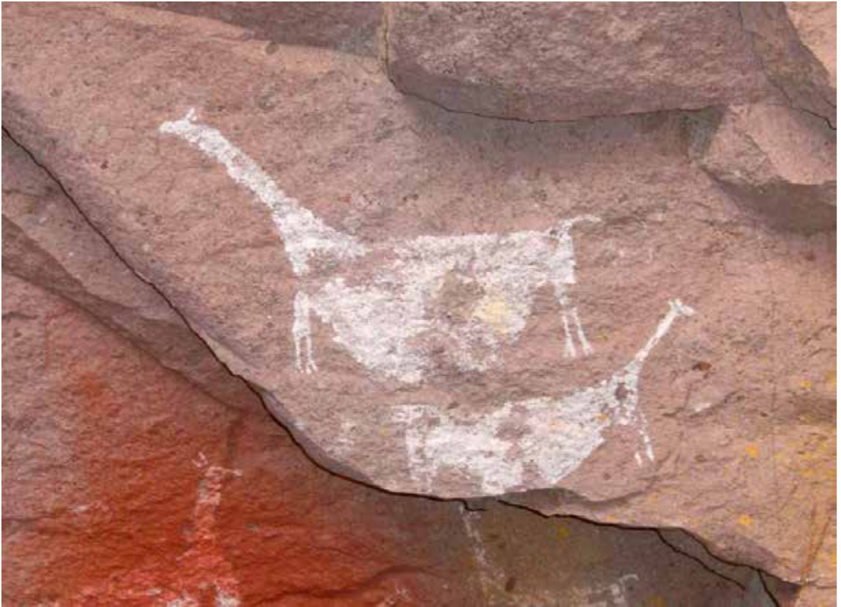
Figure 11. Charcamata, Argentina.