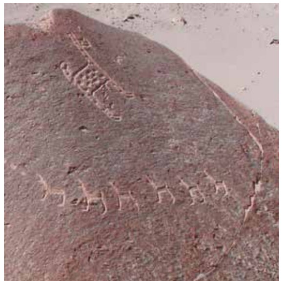
Figure 10. Toro Muerto, Peru. Figura 10. Toro Muerto, Perú.

depiction, but more than that, it fails to take into account the fact that a salient feature only makes visual sense in relation to the rest, or as an organizing principle, a highly visible part that snaps the entire configuration into focus for the observer (Arnheim 1974: 43-44). In line with his focus on contour, Deręgowski regards