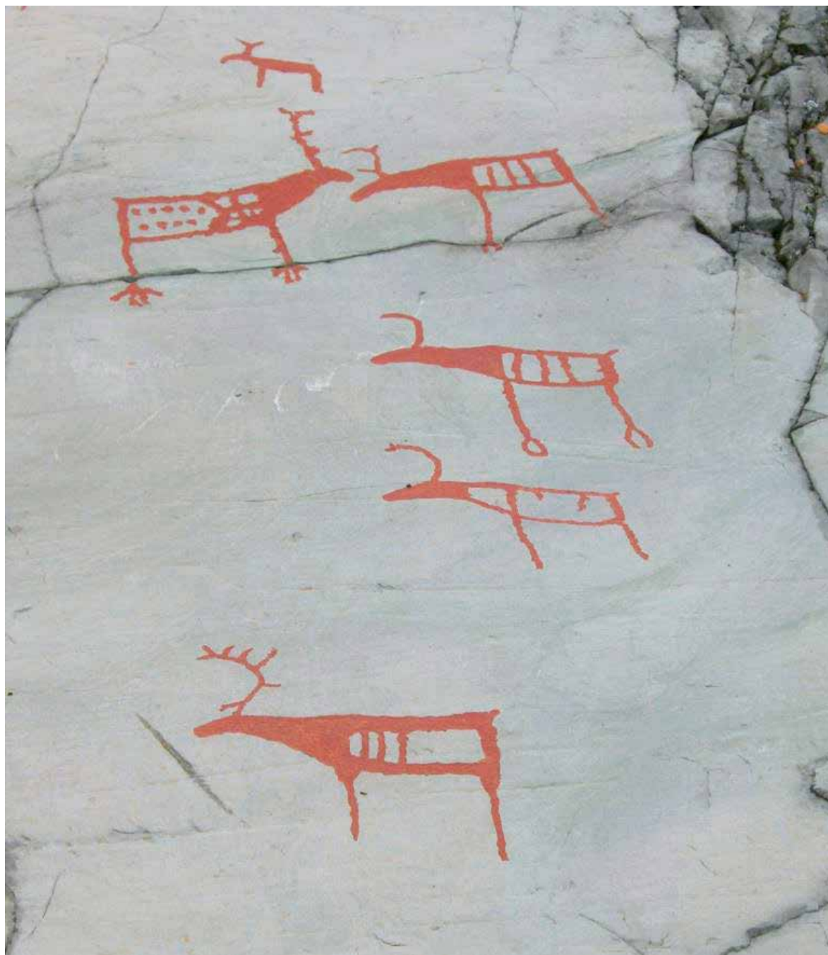
Figure 4. Alta, Norway. Figura 4. Alta, Noruega.

is worth adding that at times, either in life or art or both, two different animals will have similar canonical forms. Thus, at least in a picture, it may not be easy, in a South African case, to distinguish a rhinoceros from a wart-hog or bush pig or, in South American rock art,