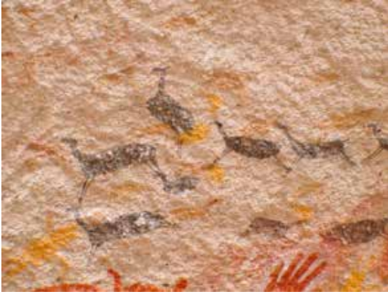
Figure 15. Cueva de las Manos, Argentina. Figura 15. Cueva de las Manos, Argentina.

simple. It may, in life if not in art, be a matter of life and death. Thus in situations of potential danger, the fact of looming proximity will override recognition, even dispense with it altogether. Clearly here it suffices to register possible coming danger and to take immediate evasive action, since it makes no difference, let us say in poor light, whether the threat is from a large feline or an angry boar. So narrative and performative situations, and therefore, depictions, may be expected to be visually dominant over canonicals. While Livio Dobrez has argued that it is impossible to register a picture as a narrative scene and as a looming performative at the same time, i.e., these modalities exclude each other, they do not exclude canonical recognition. In real life you continue to see a rhinoceros attacking you as a rhinoceros, but this is not foregrounded! It is the action that counts. So both narratives and performatives are more active and visually primary than canonicals.