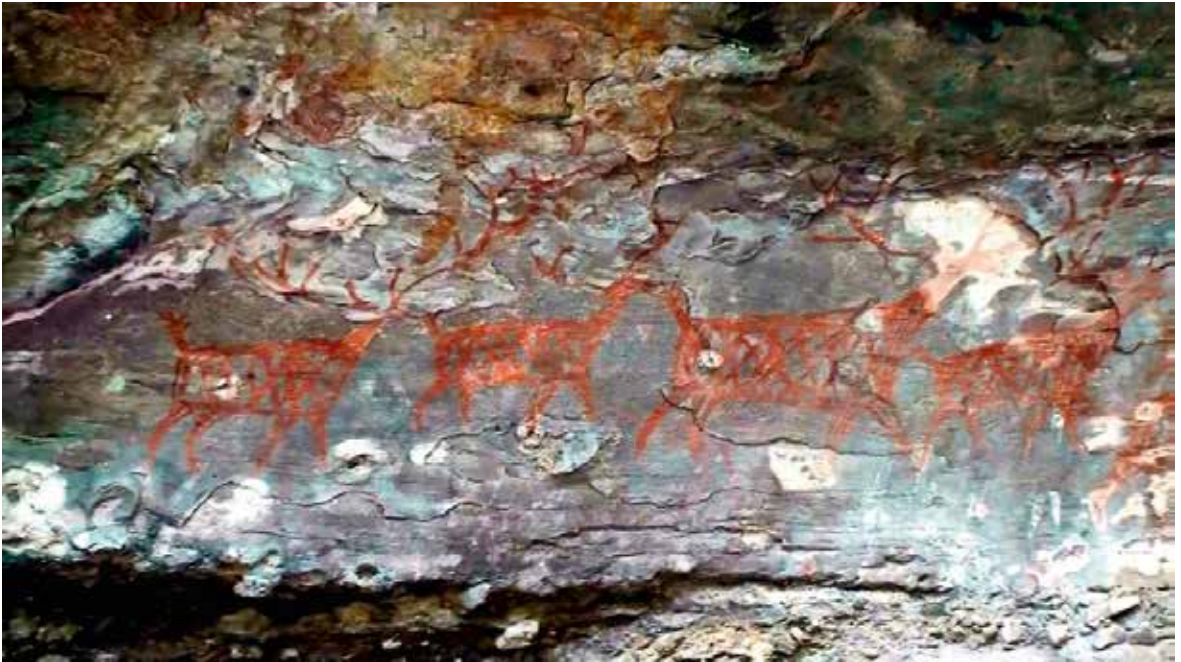
Figure 12. Bhopal, India. Figura 12. Bhopal, India.