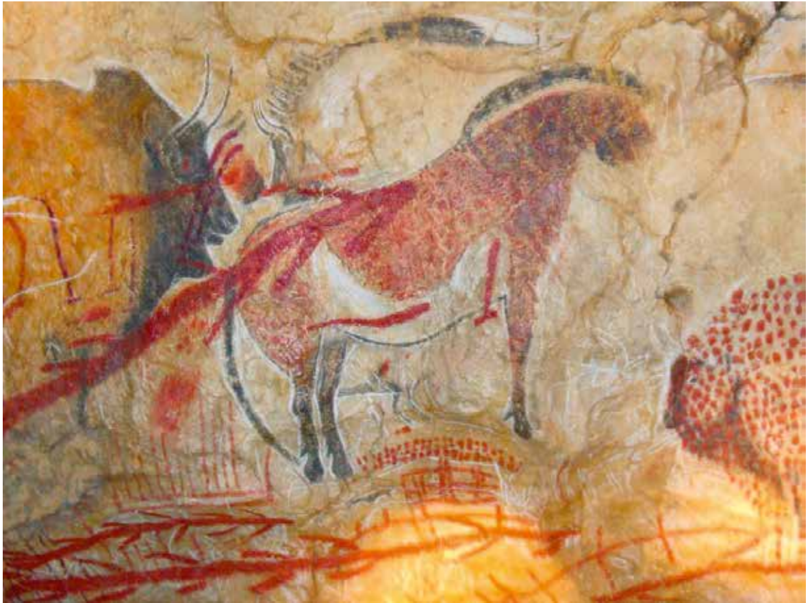
Figure 3. Marsoulas model, Parc de la Préhistoire, Tarascon-sur-Ariège, France. Figura 3. Modelo Marsoulas, Parque de la Prehistoria, Tarascon-sur-Ariège, Francia.

It may be understood in terms of what the perceptual psychologist Gibson (1979) called invariants , i.e., those features—for a horse, say the cervico-dorsal line—which are stable across the variations (“transformations”) that are generated by movement. For a dog in rock art, a significant visual marker may be a lifted tail (fig. 2). For a deer it may be horns, with specific horns indicating a specific type, e.g., reindeer, as in Alta, Norway (fig. 4). For an American feline, in this case from Varedão, Serra da Capivara, Brazil, it may be the rounded form of the head or the paws (fig. 5). For Brazilian capybara it may be a prominent, bulky head, coupled with a stocky body (fig. 6). For sheep, as for deer, it may primarily be the horns—and so on. These elements are salient and likely to be visible in any view of the animal. However, most are likely to be best recognized in profile views.