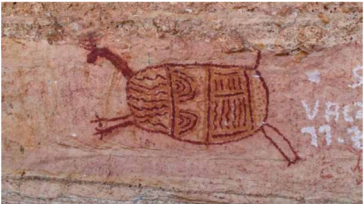
Figure 13. Serra da Capivara, Brazil. Figura 13. Serra da Capivara, Brasil.