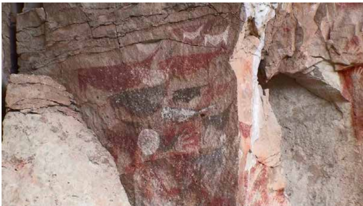
Figure 17. Cueva de las Manos, Argentina. Figura 17. Cueva de las Manos, Argentina.