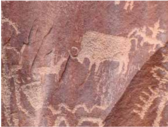
Figure 7. Newspaper Rock, Utah, USA. Figura 7. Newspaper Rock, Utah, EE.UU.