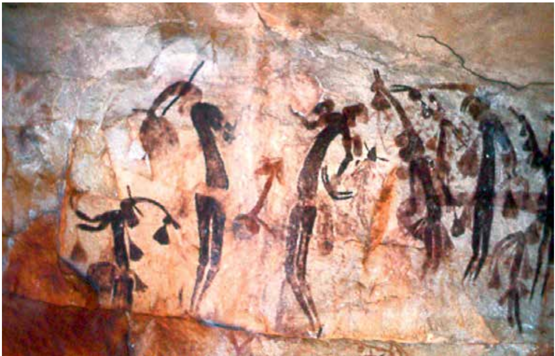
Figure 1. Kimberley, Australia. Figura 1. Kimberley, Australia.

In this paper we wish to focus on a third possible visual modality, i.e., another fundamental and, in evolutionary terms, critical perceptual situation: that of recognition of an object—in particular an animal. In the process we shall make some reference to the perception of other humans and to their depiction as stick figures. What we want to stress is that we recognize an object by its “canonical form.” After that we want to analyse the idea of canonical form and link it to what we shall call canonicals, i.e., canonical figures in depiction.