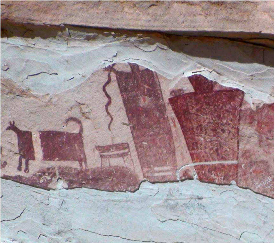
Figure 2. Temple Mount Wash, Utah, USA. Figura 2. Templo monte Wash, Utah, EE.UU.