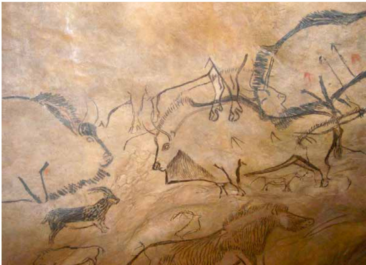
Figure 16. Niaux model, Parc de la Préhistoire, Tarascon-sur-Ariège, France. Figura 16. Modelo Niaux, Parque de la Prehistoria, Tarascon-sur-Ariège, Francia.