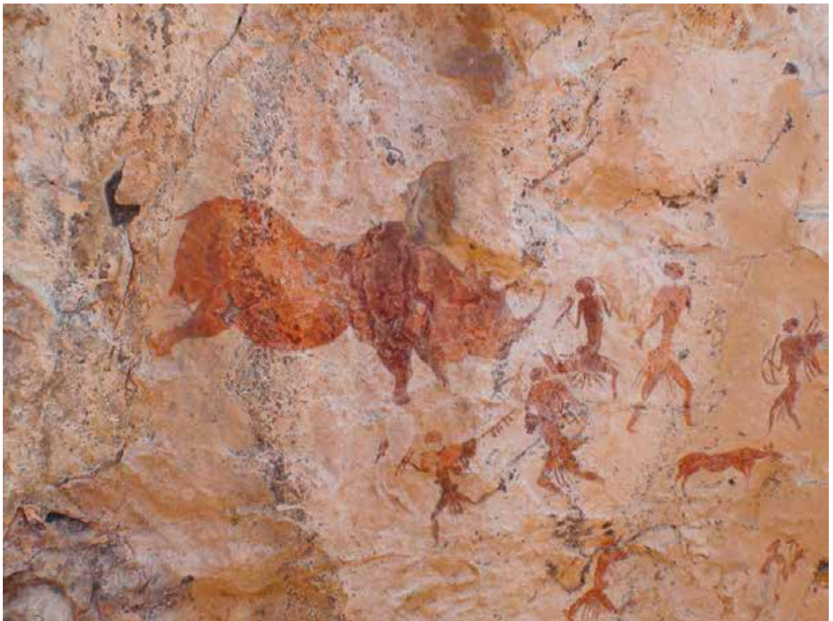
Figure 14. Noukloof Mountains, Namibia. Figura 14. Montañas Noukloof, Namibia.

is also vital to recognize objects in your field of vision, i.e., to register canonicals. Of course this third category does not exclude the other two. Thus self-evidently when you observe a scene, for example a rhinoceros attack in Namibia (fig. 14), you read the emphatic large figure as a rhinoceros. A single animal doing something (running or leaping), like the Serra da Capivara does on the left of Figure 5, also constitutes a scene or narrative image—and it too is recognized by its given canonical form. We may say the same of the famous panel of black guanaco from Cueva de las Manos (fig. 15): we observe simultaneously that "something is happening", i.e., activity is depicted (a hunt)—and that what is hunted is guanaco. Something like this applies to performative images, which, however, are rarely zoomorphic: you recognize the looming frontal as a more or less human form (fig. 2). However, to read a narrative in life (and, consequently, in art) is more important than mere recognition. Likewise to read a figure in life (and, consequently, in art) as coming towards you, confronting you, is more important than recognition pure and